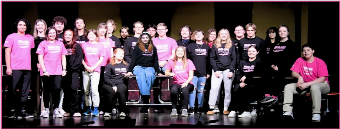
Mean Girls Cast